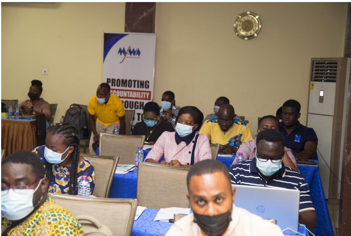
A cross-section of participants at the RTI Forum and Book launch