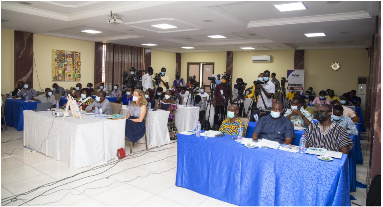
A cross-section of participants at the RTI Forum and Book launch